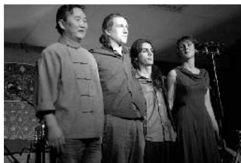
Meïkhâneh + invité